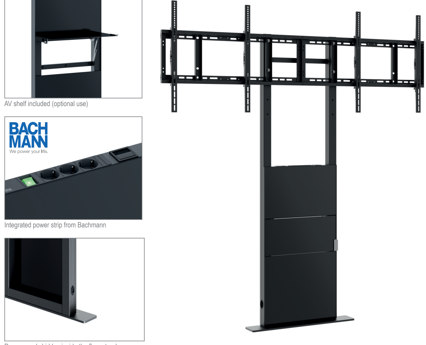
Power supply hidden inside the floor stand

Technical changes reserved | This document is the property of HAGOR Products GmbH. Forwarding and duplication of this document, utilization and communication of its contents are not permitted unless expressly permitted. A violation obliges you to pay compensation. All rights reserved in the event of a patent, utility model or design registration.