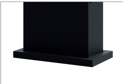
Clean floor finish thanks to the surrounding panel