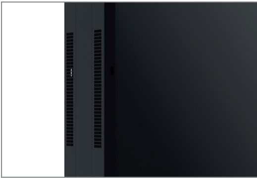
Display specific adapted, e.g. ventilation, infrared sensor

The surfaces are coated with a corrosion resistant, highly weather proof plastic powder coating in black (RAL 9005).