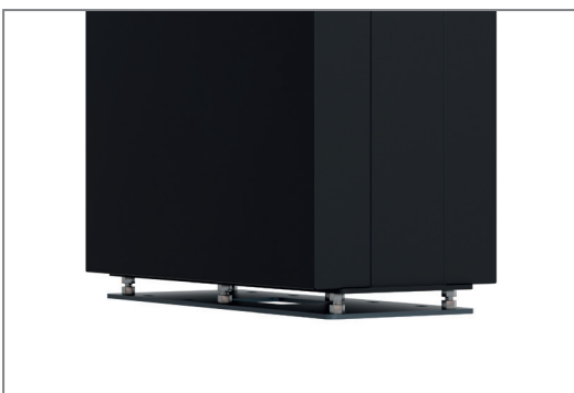
Floor attachment including level adjustment