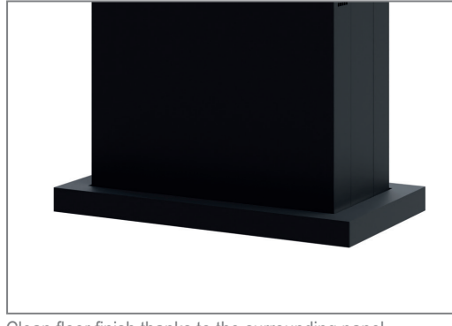
Clean floor finish thanks to the surrounding panel