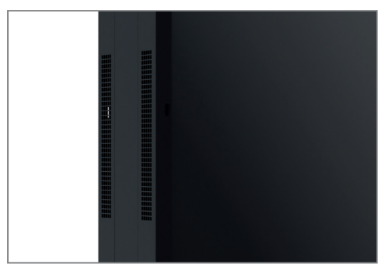
Display specific adapted, e.g. ventilation, infrared sensor